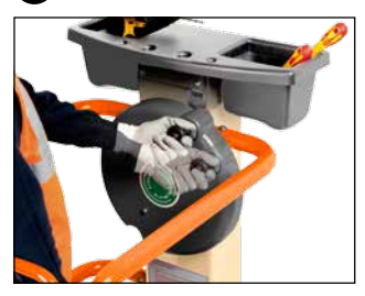
Gone are the days of climbing steps or podiums, no more slips, trips or having to balance!

The PecoLift converts 10% human energy into 100% of the power required to elevate to full working height, in just 11 seconds!