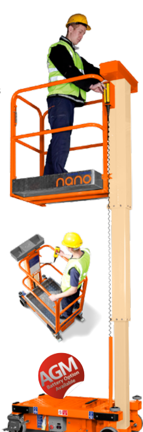
Largest platform size in class; small working footprint.

Applications: 2nd Fix. Spot Work. Pipe & Ductwork. M&E. Shopfitting. Retail.