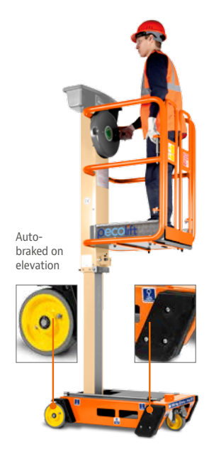
You're fully guarded from the ground up. And being virtually maintenance free, it's so simple!

Stop wherever you want up to 3.5 m working height.